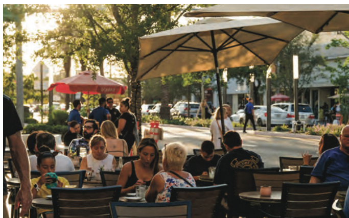
Outdoor dining on Miracle Mile