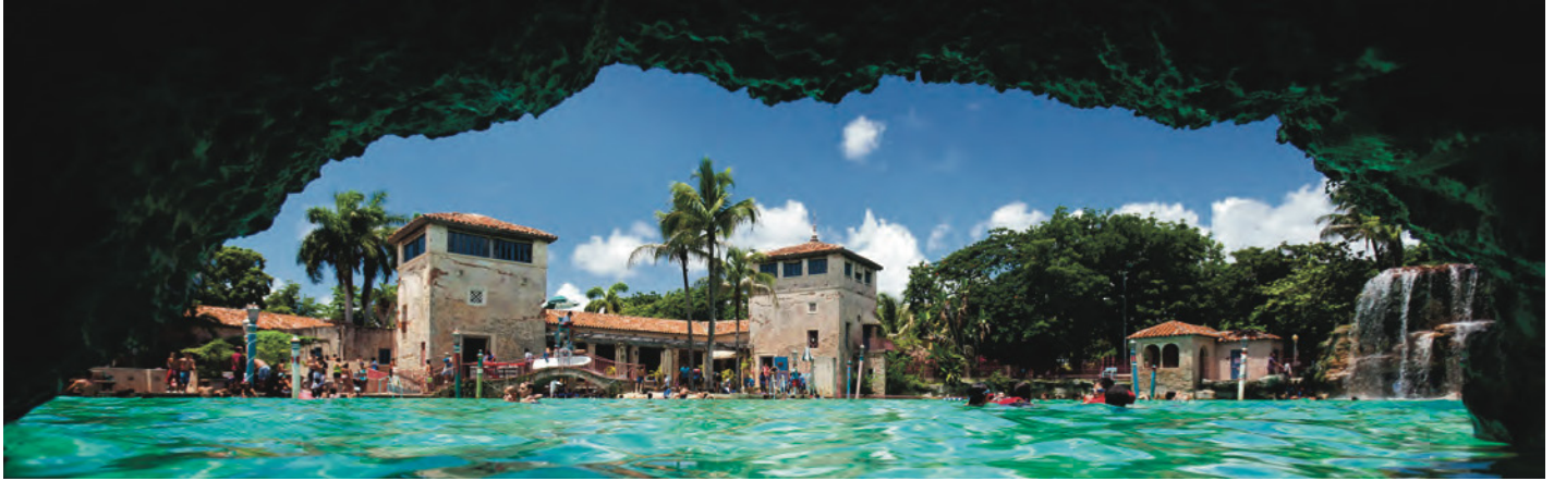
Venetian Pool