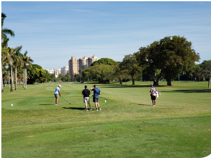
Granada Golf Course