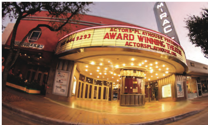
Actors' Playhouse at Miracle Theatre