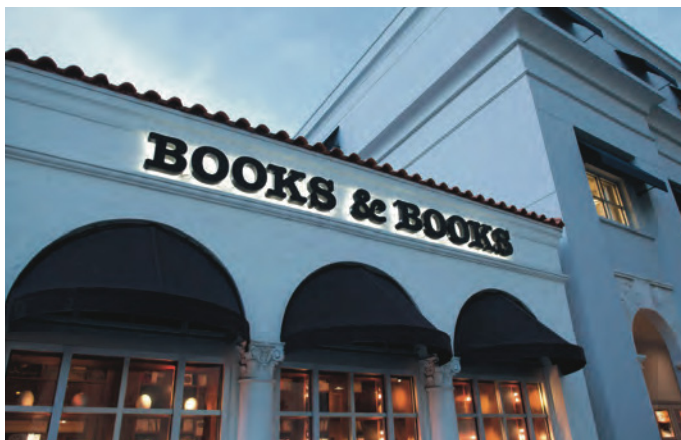
Books & Books