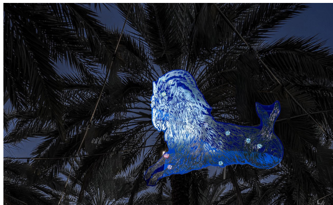
Kiki Smith, Blue Night at Giralda Plaza