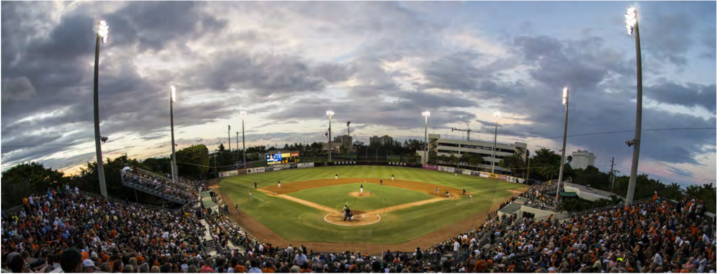
Alex Rodriguez Park at Mark Light Field, UM.

Coral Gables is in close proximity to a wide array of sporting events, both professional and collegiate.