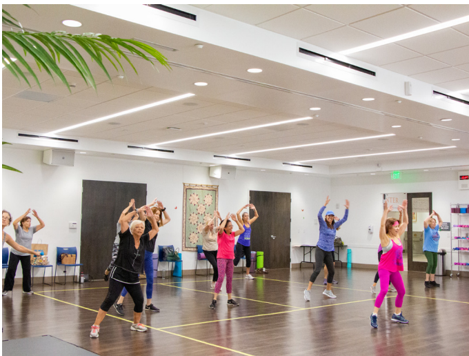
Adult Activity Center

With its majestic tree canopy and shaded streets, Coral Gables invites communing with nature. There are 62 public parks and green spaces in the City Beautiful, providing perfect places to stroll, picnic, play or relax. The City's parks and green spaces are evolving to better serve the community. Thirty parks are now dog friendly areas and the City is incorporating public art wherever possible.