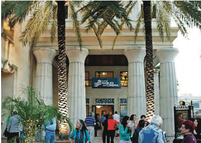
Coral Gables Art Cinema

Coral Gables has become one of the most vibrant centers for the arts in South Florida, with countless cultural offerings located both in the heart of the City or just minutes away.