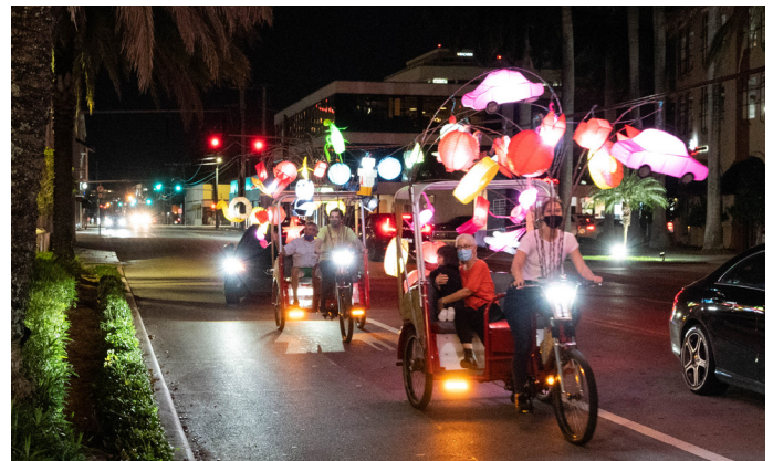
Fireflies, pedicabs from Illuminate