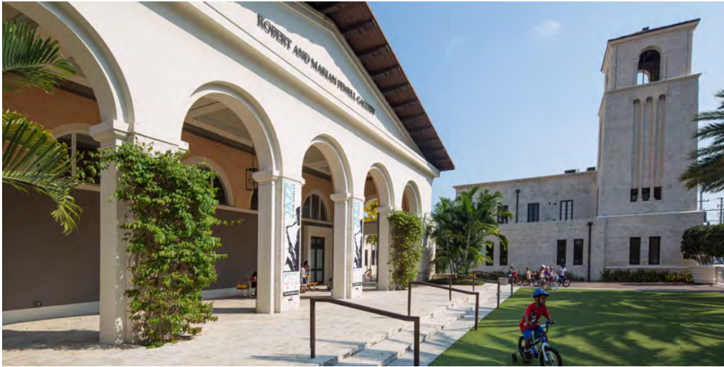
Coral Gables Museum