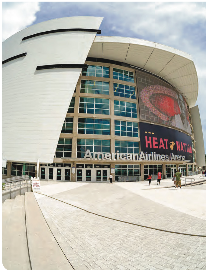
American Airlines Arena