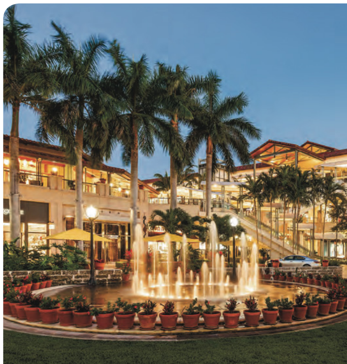
The Shops at Merrick Park