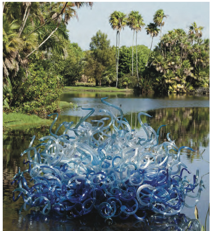
Chihuly art at Fairchild Gardens