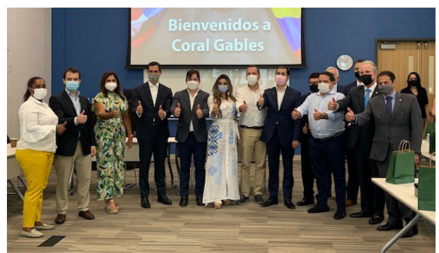
Colombian Delegation visits Coral Gables