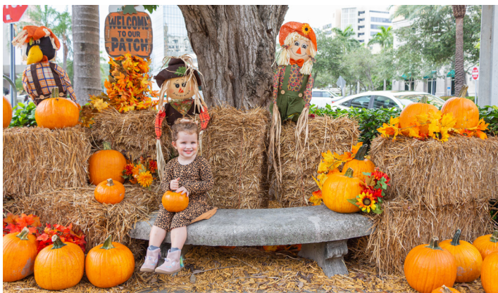
Pumpkin Patch at Pittman Park