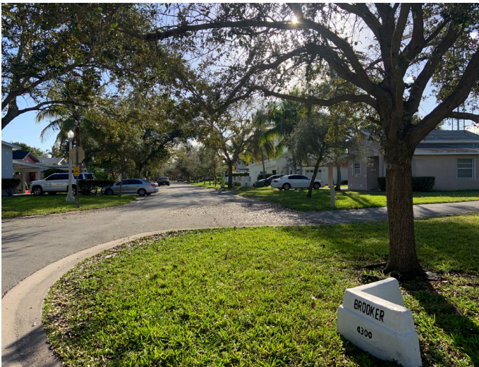
MacFarlane Homestead Historic District